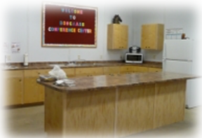
Bomgaars Conference Center 32' x 60'